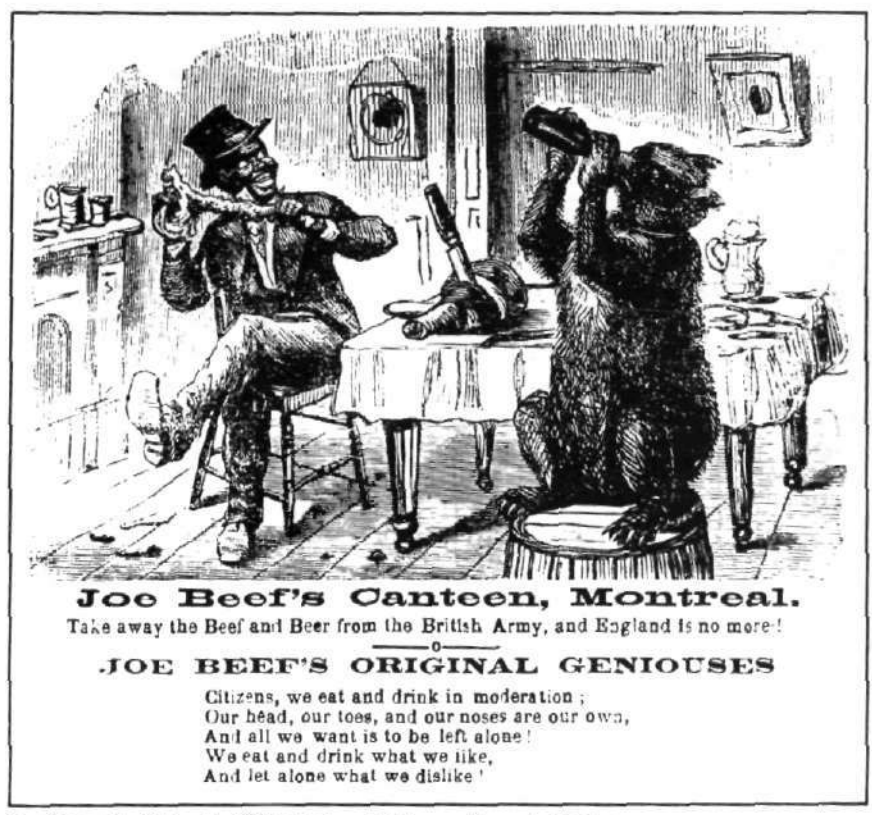
(Le Canard, 29 April 1874. National Library Photo L 8707.)

and curios. One bottle preserved for public display a bit of beef which lodged - fatally - in the windpipe of an unfortunate diner. The quickwitted McKiernan served his patrons with an easy manner. An imposing figure with a military bearing and fierce temper, the owner had few problems with rowdvism. 12