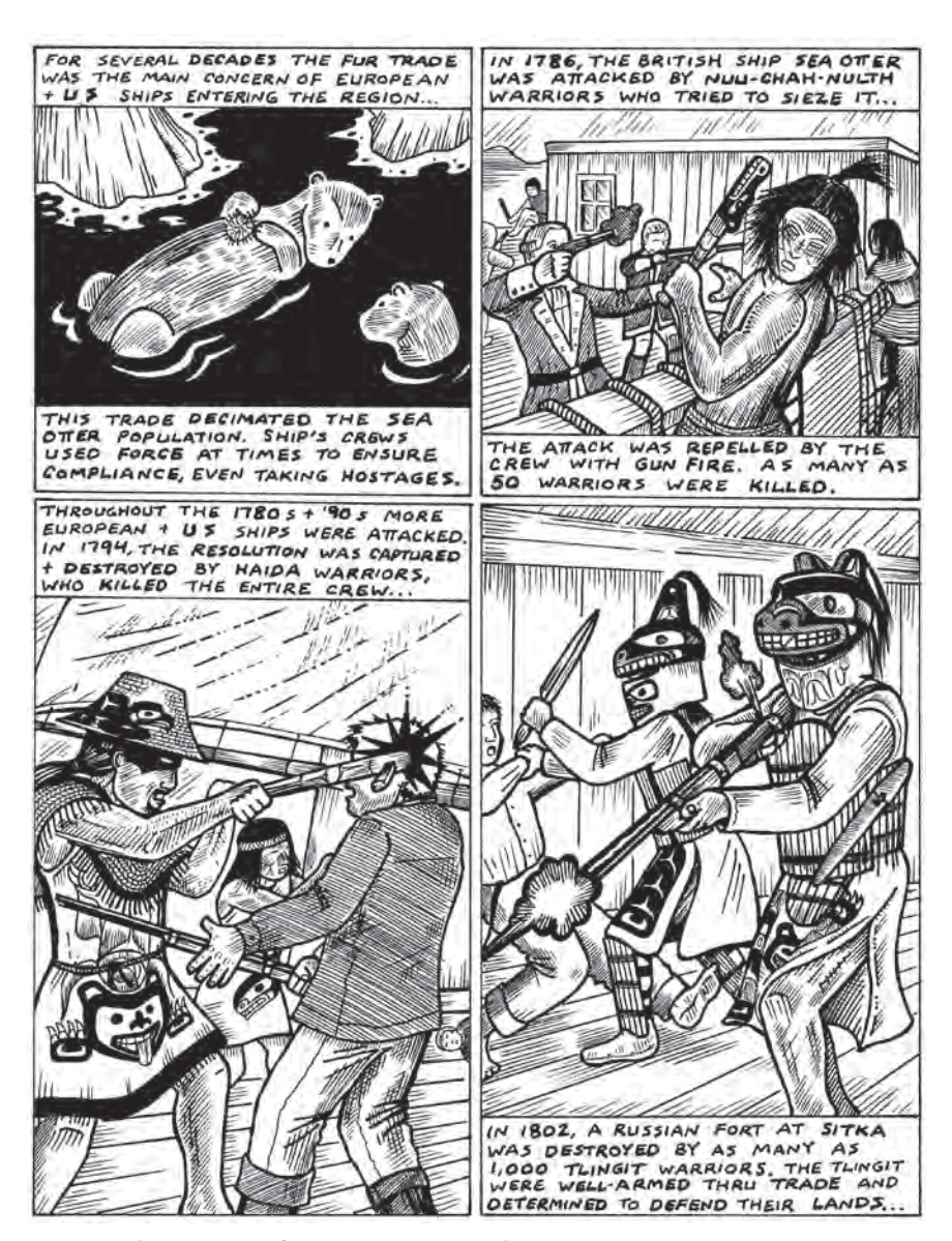
Figure 4. The 500 Years of Resistance Comic Book, 53. With permission.

panels highlighting recent actions in Canada by the Mi'kmaq in 2000 and the New Caledonia blockade by Six Nations members in 2006, respectively. These two panels serve to link seemingly isolated "Canadian" events to the strong Indigenous movements for liberation throughout the Americas today.