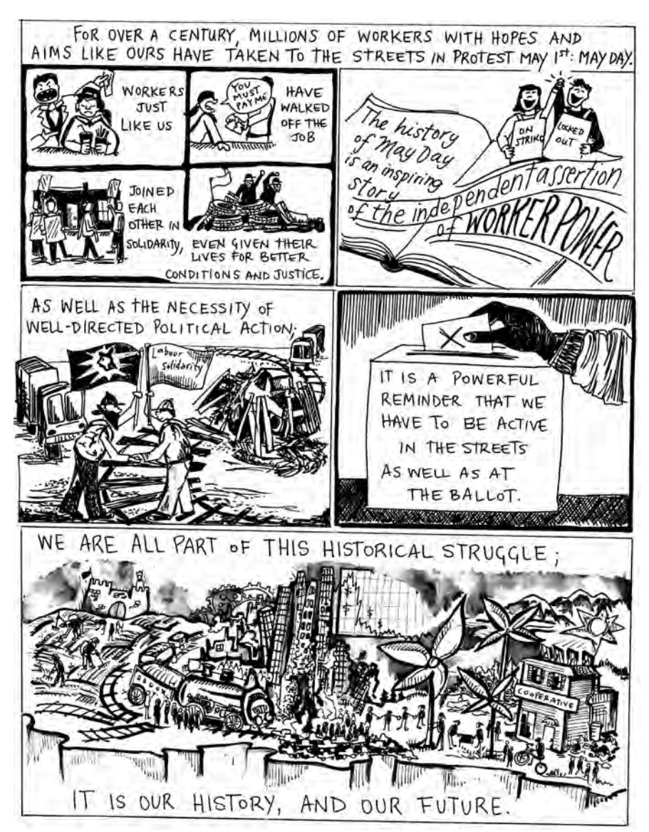
Figure 2. May Day: A Graphic History of Protest, 28. With permission.

transitions across gutters and linking together different fragments of information, both textual and visual, contained in and between panels.