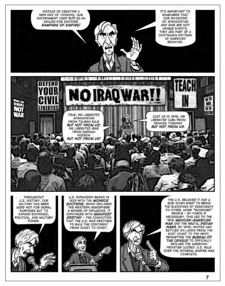
Figure 1. A People's History of American Empire, 7. With permission.

War, delivering a lecture on America's sordid history of imperialism (Figure 1). Zinn's talk is aided by a mixture of historical narrative, photographs, and comics art that trace the roots of American expansionism from the 1890 massacre at Wounded Knee to the invasion of Iraq in 2003.