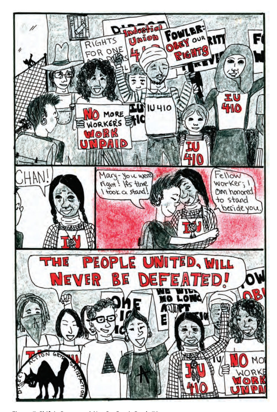
Figure 7. Shift in Progress: A Not-So-Comic Book, 72. With permission.