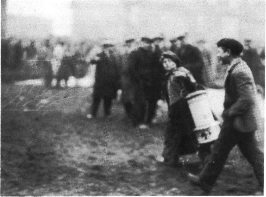
Boys carrying away oil stove during riot at Colonial Building, April 1932.