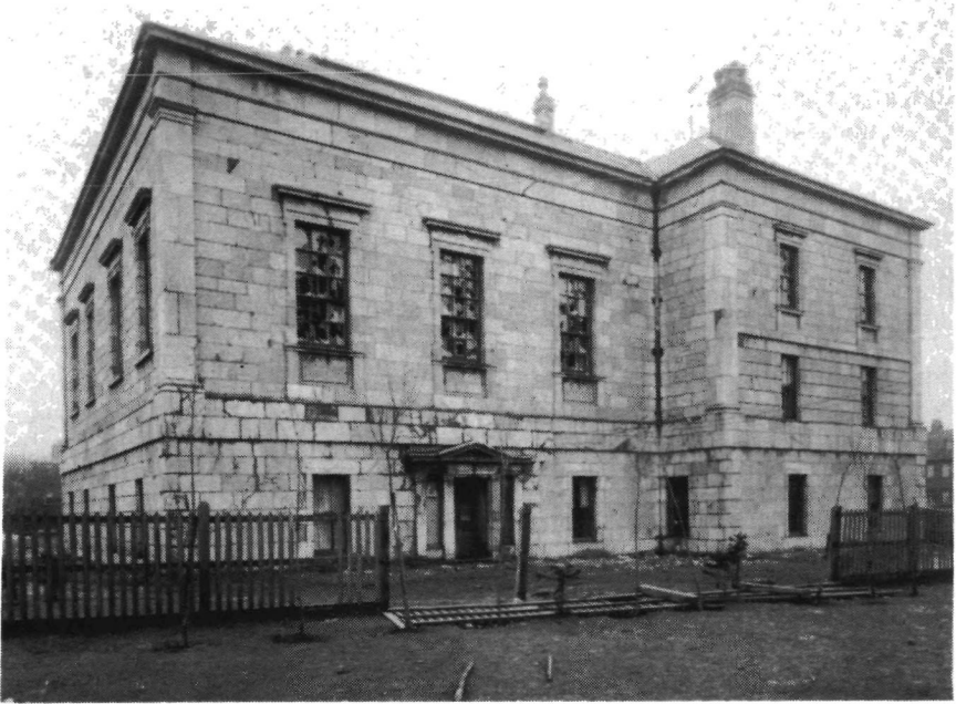
Colonial Building Riot. Circa 1932.

The violence of early April had serious repercussions. Immediately, the Government decided to expand the police force in order to strengthen its ability to maintain law and order. An auxiliary police force was also raised. But the incident also led to the government's demise. No longer able to control the situation, and with his support melting away, Squires had little choice but to call an election. The breakdown of law and order was further evidence that his government could govern no longer.