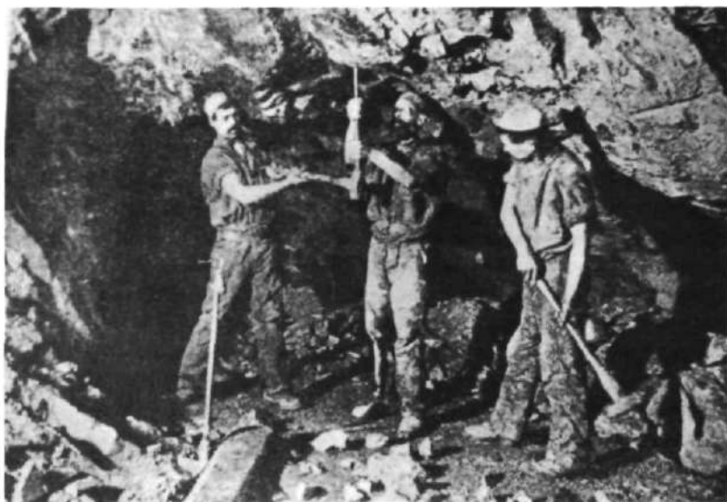
Underhand drilling in a typical stope. (Canadian Mining Journal, 1917).

a hammer. The Right-of-Way Mining Company was laughingly described as "seven men, three planks and a wheelbarrow, to which has been added a couple of candles for the nightshift." 23 The first shafts resembled wells with ladders down the side. They were timbered around the opening and a small bucket was lowered down the shaft by means of a winch or windlass. Although pneumatic rock drills had been introduced into Canada well before the turn of the century, hand drilling was the accepted practice at Cobalt in the first few years, because the owners (many of whom were operating on a shoestring budget) were unwilling to undertake large capital expenses until the silver veins proved out at depth. As usual, it was the miners who bore the brunt of the companies' parsimony. Despite this prevailing fear that the silver veins were only surface deep, modern mining methods were adopted after 1907 and the silver veins were followed to greater depths. Open quarrying gave way to shaft mining. The number of men employed underground increased from 186 in 1905 to 1,089 three years later, and the total value of mining machinery rose to a million dollars. 24