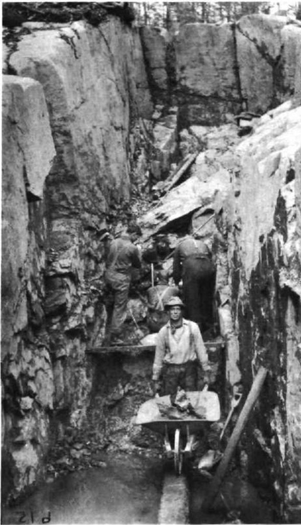
Open-cut mining practices.

reading material was provided, suitable movies were selected, and consumption of alcohol was limited. Perhaps most important, the growth of union activities could be checked before they had a chance to take root.