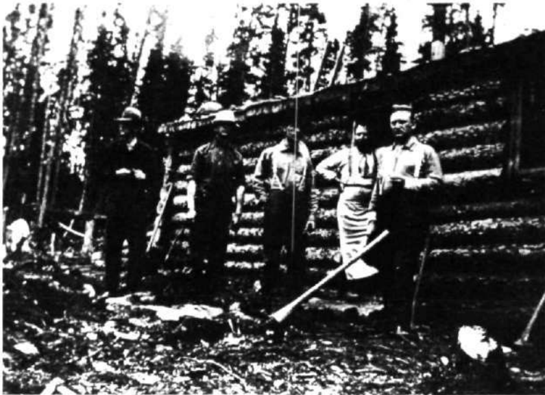
This is a typical bunkhouse in the Cobalt camp.

The erection of bunkhouses allowed the mining companies to exert greater control over the extra-curricular activities of its employees than would otherwise have been possible. Recreation pastimes were directed and supervised by the company's staff, "proper"