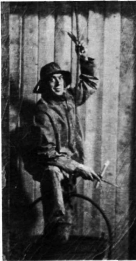
The miner, dressed in wet clothes, is about to descend into the shaft perched on an ore bucket. Note the candle in one hand and the dynamite in the other. The photograph was taken from a postcard written in 1907.

discover a valuable ore deposit, sell it for a profit, and return home to live in comfort. These prospectors were followed by the entrepreneurs who were willing to take a chance on the property for a relatively small sum. 2 The first shipments of ore consisted almost entirely of rich silver nuggets taken from surface excavations. This not only permitted the capitalists to purchase machinery and to begin a more systematic development of their property, but also ensured that Cobalt would not become a one-company town. 3