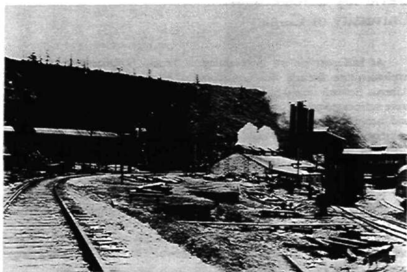
The Number One Bellevue mine, scene of Alberta's first mine disaster in 1910.