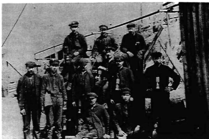
A group of miners using Davy safety lamps in 1910.