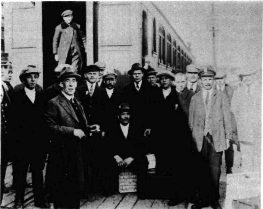
Men in front of a train car.