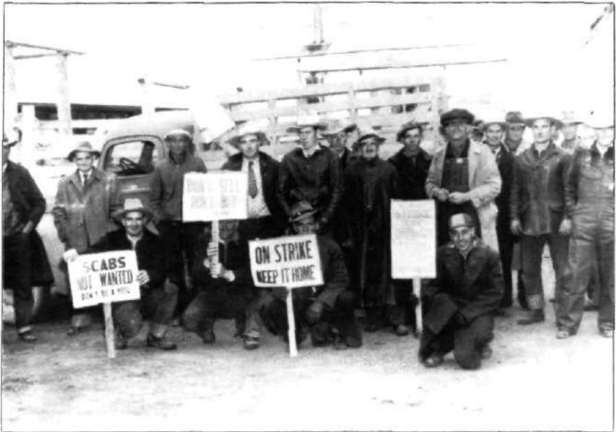
Farmer pickets at Olds during Alberta Farmers' Union delivery strike, blocking Mountain View Livestock Co-op yard, Sept. 23, 1946.