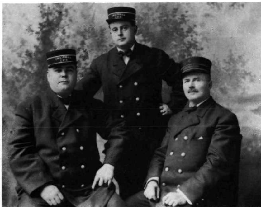
Group of CPR employees, c. 1911. Public Archives of Canada PA 42814.

This expansion included Canada. The ORC entered the Dominion in 1880, and the BRT in 1885, and by the end of the decade, both unions had local branches from coast to coast on all three of the country's major railway systems, the Grand Trunk, the Canadian Pacific, and the Intercolonial. Although Canadians never made up more than seven per cent of the two brotherhoods' total membership, they proudly styled themselves as international organizations, and Canadian members enjoyed a certain prestige, if not influence, as living symbols of international status. 2 On their part, Canadian conductors and trainmen gradually developed a sense of loyalty to the brotherhoods which, as subsequent events were to prove, was stronger than any feelings of obligation they might have had for the companies which employed them, including the Canadian Pacific. 3