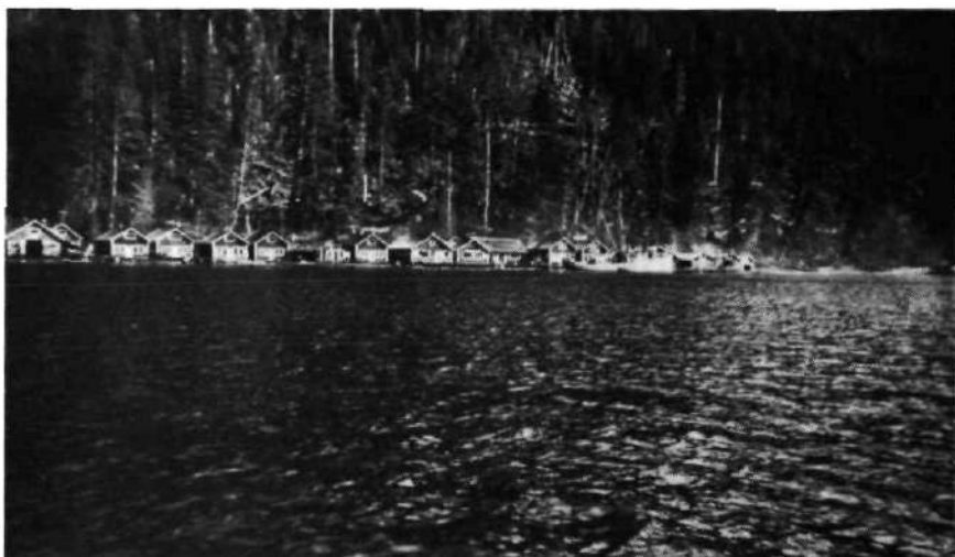
Morgan's floating logging camp. Queen Charlotte Islands, circa 1943-44.

left-wing power base being built in British Columbia would have to be reckoned with. As the organizers left the islands for the mainland, the anti-communists prepared to challenge the left for control of the District.