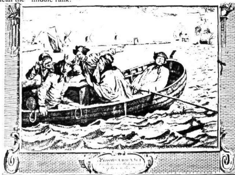
Tom Idle Goes to Sea, An Excerpt from William Hogarth