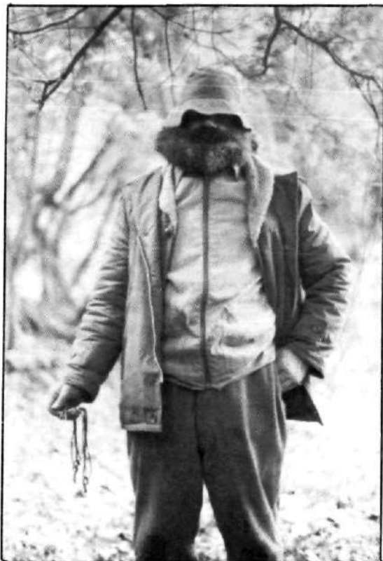
An Unexpropriated Romany Man Holding Rabbit Snares, Worcestershire, Winter 1979

This comes from a somewhat later period but in showing us some of what the Romany knew in order to survive, it can show what others might learn from them. 18