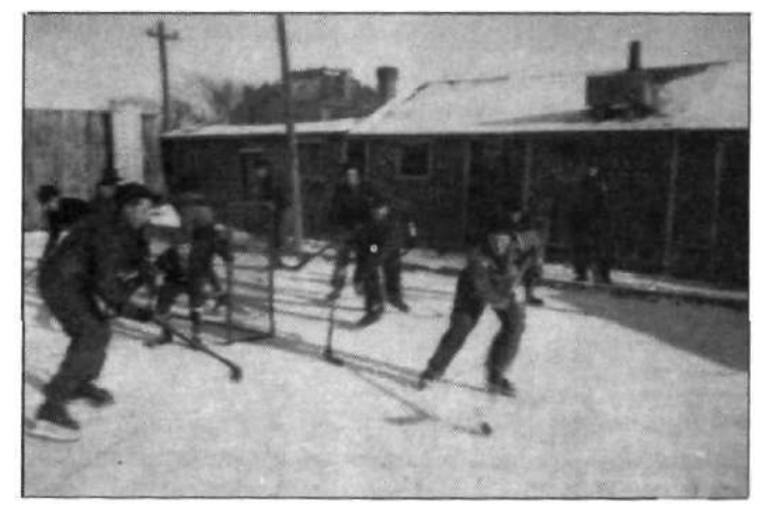
Hockey at East End Rink, 1934 and 1937