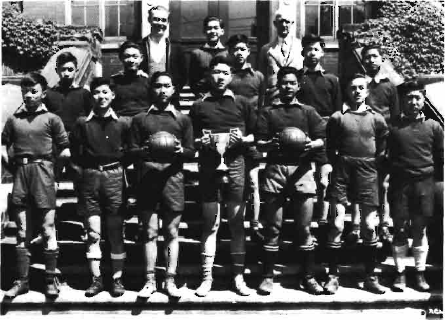
The distinctive racial character of the East End is evident from an elementary-school soccer team of 1920.

Increasingly the district west of Cambie will be occupied by those engaged in commercial pursuits with growing incomes and cultures. The district east of Cambie, speaking generally, will be occupied by artisans and skilled workers. The Oriental section [of the population] and unskilled laborers are apt to be on the fringe of the Oriental section [northeast of Cambie across False Creek] and on the fringe of industrial areas [principally around False Creek at the north end of Cambie]. 24