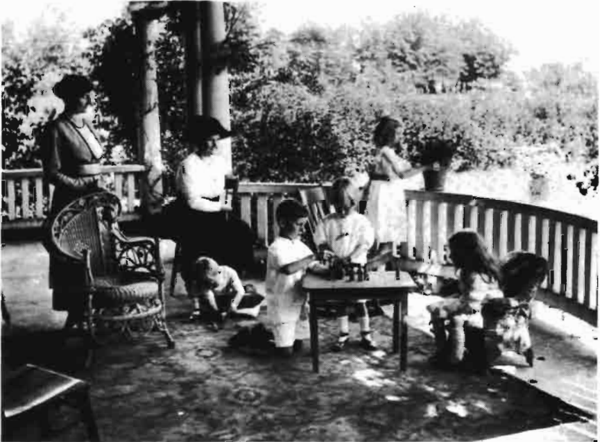
The physical settings in which middle and upper-class children spent their leisure time in Vancouver during the 1920s differed considerably from those where the children of working people played. (City Archives, Vancouver, B.C.)