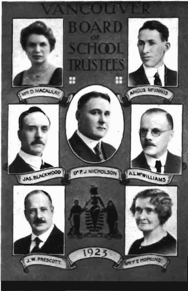
(Vancouver Board of School Trustees, Annual Report , 1923)