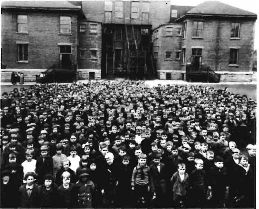
The overcrowding which typified Vancouver Schools by the early 1920s was emphasized in a 1924 pupil photo.

Between the West and East Ends lay the city's semi-residential Business District. 32 While the East Side was identified primarily by the wage earning character of its residents, the East End had become even more distinguished by its inhabitants' race, ethnicity and poverty.