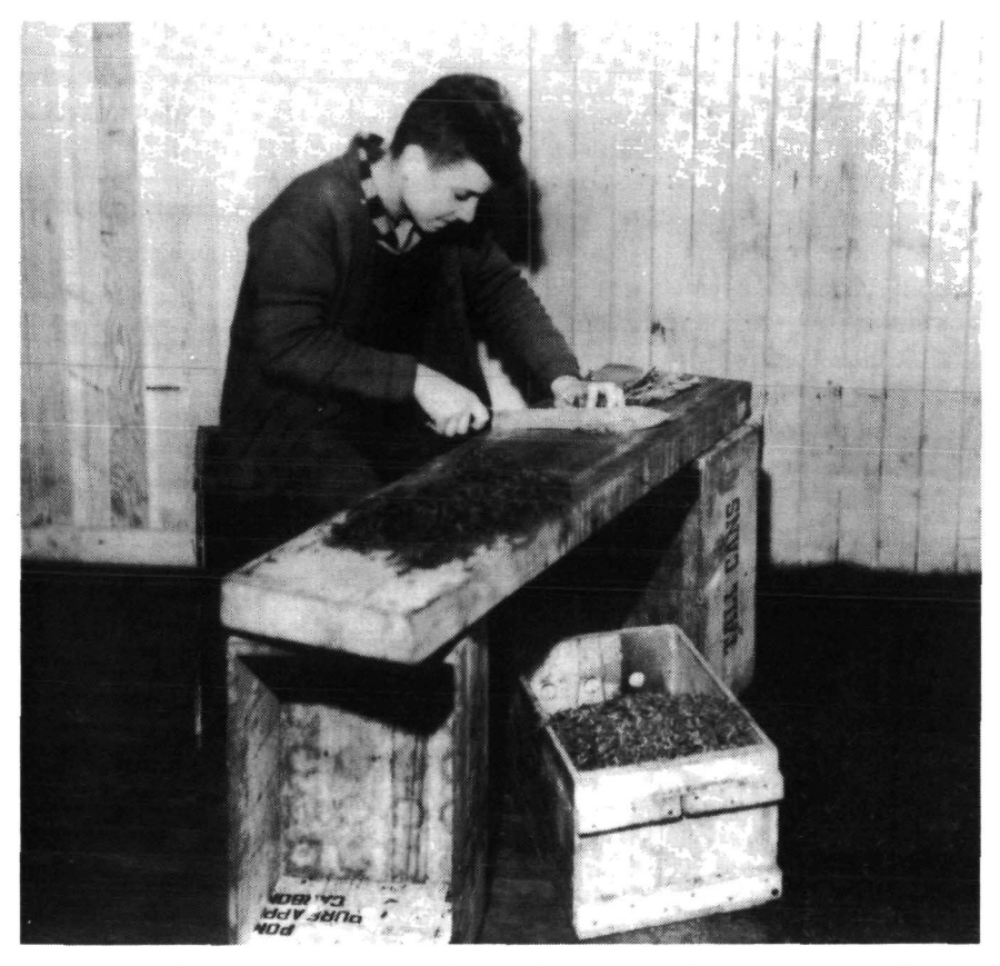
A youth - perhaps just old enough to leave school - cuts tobacco at the Jack Canuck Tobacco Company: Vancouver, September 1931.

full-time at housekeeping and child care. As a Cedar Cottage woman pointed out, "our life was very ordered. Mom stayed at home, Dad went to work, and kids did 'kids' things."" In both classes, "kids' things" included attending school regularly.<sup>13</sup> As early as the end of World War I, middle-class families commonly expected children to complete junior matriculation at least. "There was," reported one woman, "a Kerrisdale tradition of a lot of high school graduates [and] about a quarter going on to university." In the 1920s, working-class families generally expected their children to complete their "entrance" examinations. Then, as they approached school-leaving age, they and their parents began the search for a job.