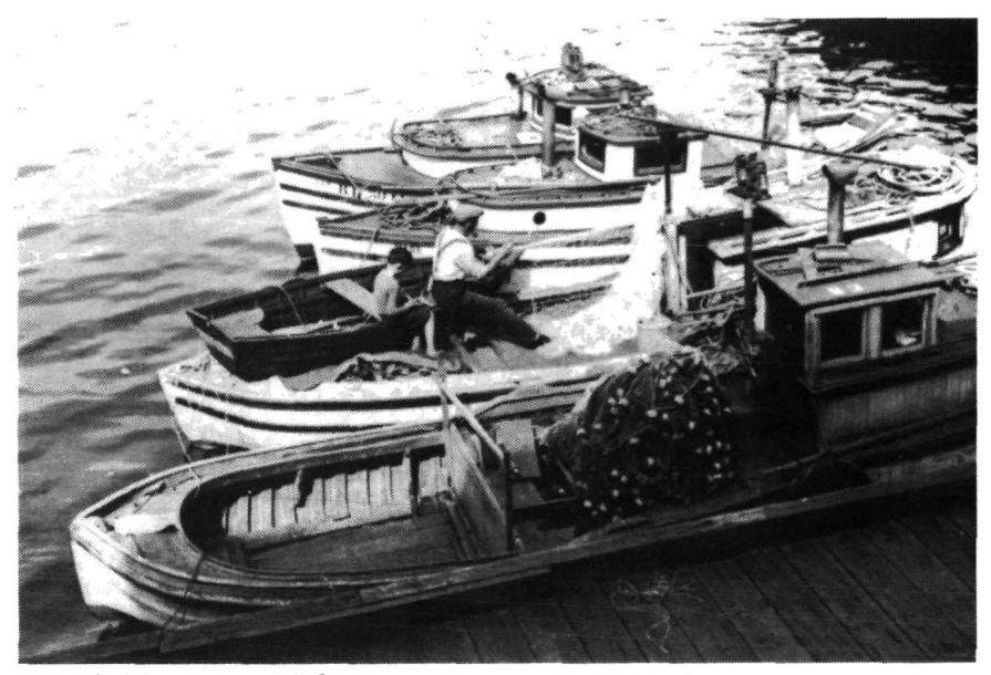
A boy helping to mend fishing nets.

cut the lawn." Postwar affluence gradually turned "taking out the garbage" into a real chore. Ever-proliferating forms of packaging, and the ever-thickening news-papers that were no longer needed to light stoves and furnaces, combined into enough waste-material to make wrapping and carrying out the daily garbage, and care of the area around garbage cans, into a regular chore, especially in middle-class homes.