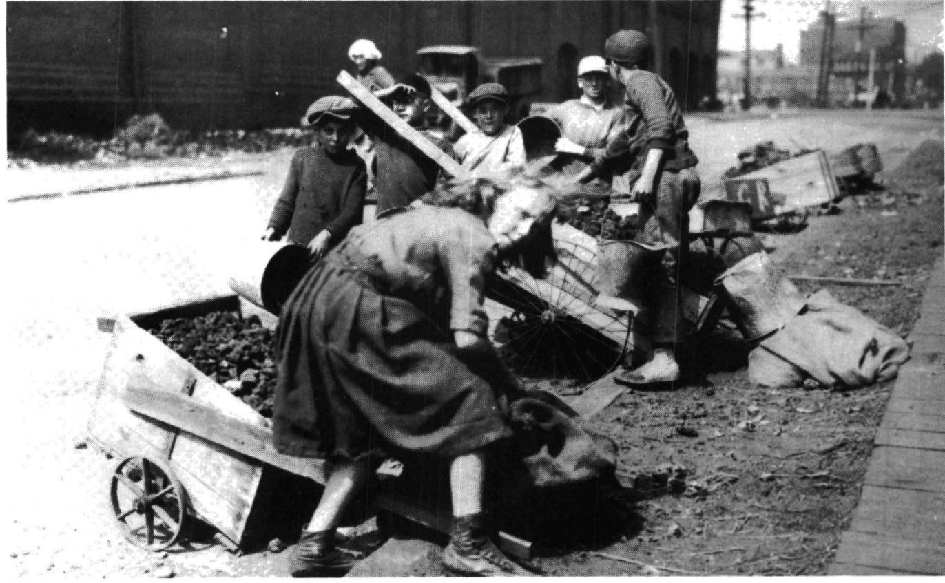
Toronto children picking over cinders, discarded by the Gas Company, for use as fuel: 31 August 1923.