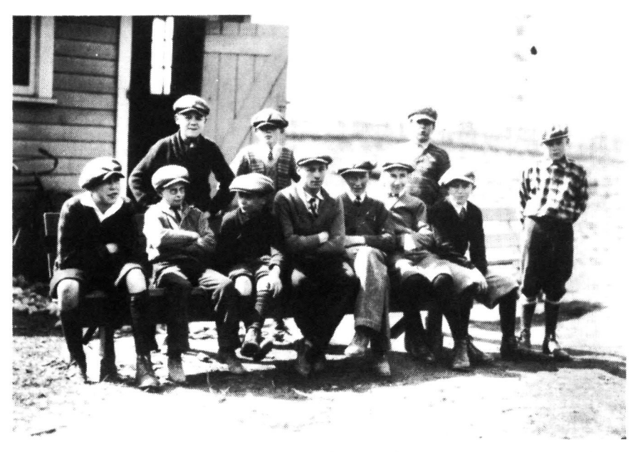
Waiting for work at a public golf-course 'caddy shack': Vancouver, April 1927.

"earned good money. I worked from 7:00 to 10:30 four nights a week [in a bowling alley] and earned between $60.00 and $70.00 a month!" During summer holidays, a few boys, most near school-leaving age, found full-time work in factories or canneries or on farms. In 1927, for example, the provincial labour department "found four boys, one in a boiler shop, two in a cold storage plant and one in a woodworking plant."<sup>35</sup> In 1928, the department permitted 17 children under age 15 years to work in canneries; in 1929, 24 children, and in 1930, 18 children.<sup>36</sup> When he was nine years old, Sing Lim began to spend his summers working full-time on the farm run by one of his father's friends. "I was probably more a nuisance than a real help that first summer," he reported. "We worked from 6:30 in the morning to 7:30 at night every day except Sunday, when we finished at noon."<sup>37</sup>