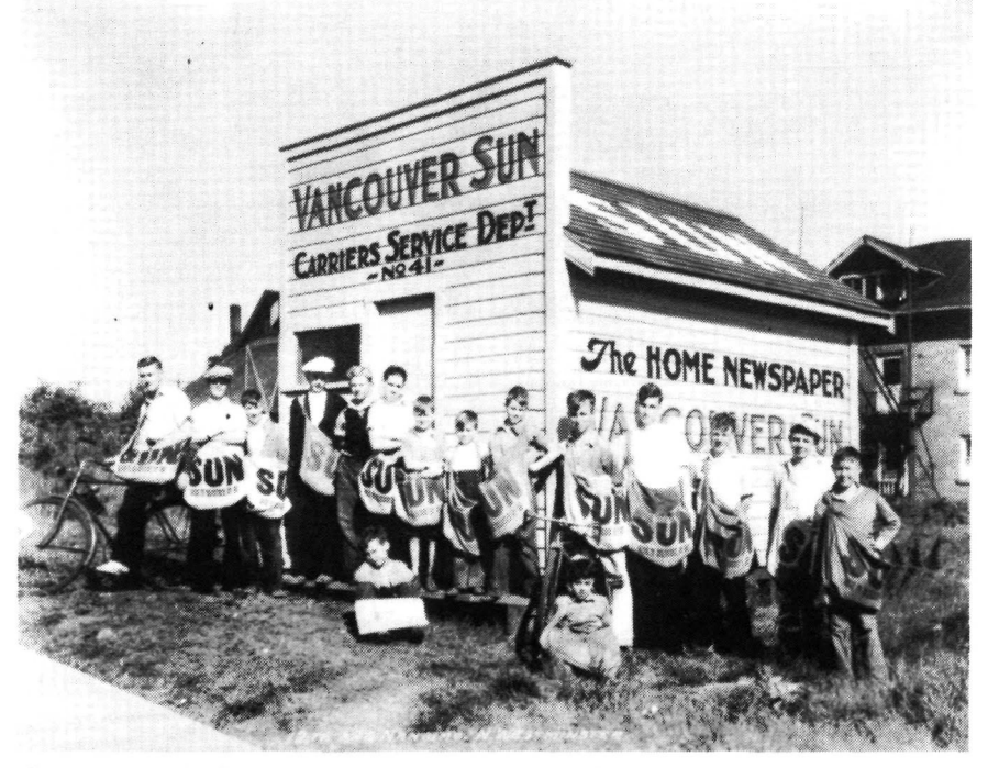
Carriers await their papers at a newspaper 'shack': New Westminster, 1933.

Newspaper routes ranged in size from about forty papers to just over a hundred. One boy "got up at 4:00 a.m. and had forty papers to deliver", another "had about 80 to 90"; a third "delivered in apartments, with approximately 100 subscribers." Most boys had to show the sub-manager that they had a bicycle with a large metal carrying basket or carrier before they could get a delivery route. In fine weather, boys found their task a pleasant one, with opportunities to chat with friends and customers. When it rained or snowed, however, they "wrapped their papers in brown waxed paper" and worked through their routes as quickly as possible, often returning home soaked to the skin.