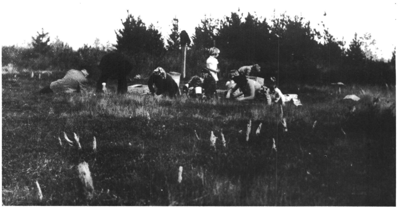
A family hand-picking cranberries at the Smith farm, Richmond, B.C.