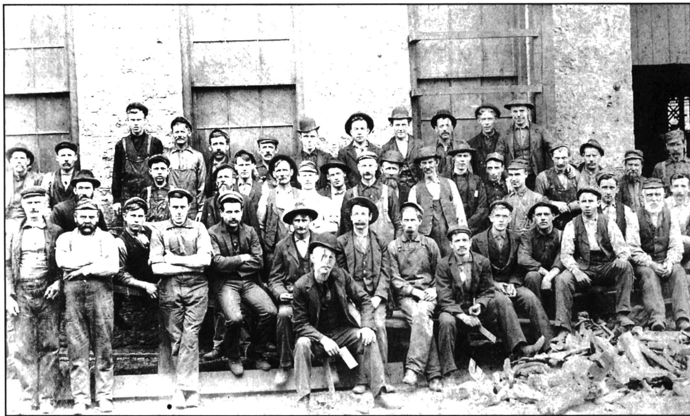
A group of workers outside the Goldie & McCulloch Foundry circa 1890. Photo courtesy of City of Cambridge Archives (CCA, PH 3020).