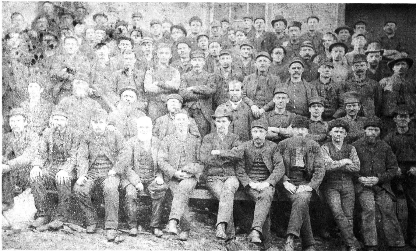
The workers of Cowan & Co. produced engines, boilers, and a variety of machinery.