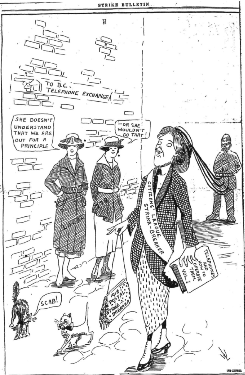
Vancouver Strike Bulletin, 20 June 1919.