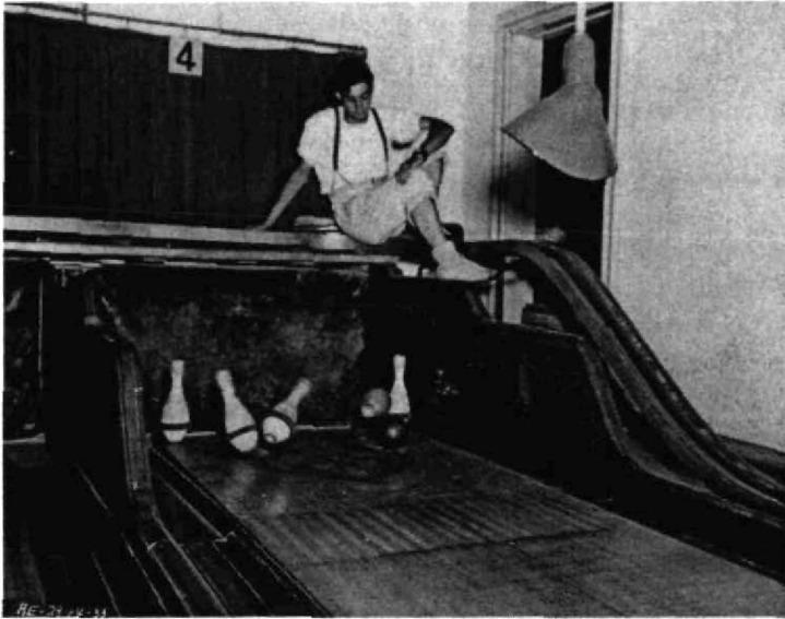
Pin-boy waits to reset pins as the camera catches a promising strike in motion. R.C.A.F. Convalescent Hospital. 6 August 1945.

good bowlers (good tippers), soon got to know who the best pinboys were. Working the major [bowling] leagues, you soon learned who to knock over the odd corner pins for or who to set the head pin just ahead of the spike for, this of course made it almost impossible to get a strike. Each boy kept track of games or lines bowled and at 12:00 on Saturday night we got paid, less whatever number of Cokes we had at five cents each through the week or chocolate bars which were also a nickel. The manager, I can't remember his name, always shorted us 25 or 30 cents. It doesn't seem like much now, but to earn 30 cents, you had to set 20 lines or about one and a half hours of bowling on two lanes. 17