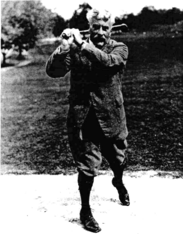
Prime Minister Robert Borden completing swing, circa 1920-1937.

was no exception. Craft unions, and later socialist organizations, were at the forefront of public campaigns against Sunday restrictions on recreation. 49 In 1895 four members of the Toronto Golf Club were charged with playing golf on a Sunday. However, the distinction of class appears to have provided them with a reprieve from the civil and social strictures placed on other sports. They were acquitted when the judge ruled that golf was not a noisy game similar to those proscribed by law such as the traditional working-class sports of football or baseball. Yet down to the interwar years many golf clubs made perfunctory concessions to the supporters of the Lord's Day Act by not employing caddies on Sundays. Women were also not allowed to play golf on Sunday mornings at many