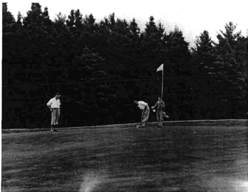
Pair of golfers putting on a green as a caddy holds the flag and bag of golf clubs. Ottawa Hunt and Golf Club circa 1925.

instance, formerly carried half a dozen clubs in a light cotton bag. However, the introduction of “balanced sets” and a few extra clubs in a leather bag “put it in the heads of caddies that theirs is no longer a light occupation calling for small remuneration.” 84 Undoubtedly it was correct that sets of golf clubs were becoming heavier. During the interwar period professional golfers were paid by golf club manufacturers to endorse clubs and were remunerated on the basis of each club they carried. The Oxford Companion To Sports And Games noted that, “This led to the practice of professionals, or their long suffering caddies, carrying up to 30 clubs at a time and so, in 1938, the authorities fixed a legal limit at 14 clubs.” 85 Amateurs were of course always eager to mimic their mentors and thus a bursting