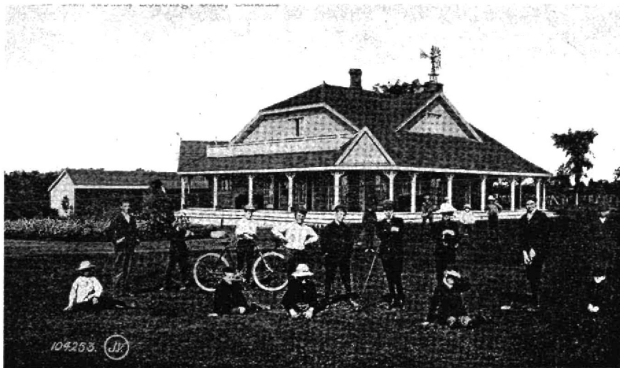
Golf Club House, Cobourg, Ontario. Caddies in the foreground displaying their wares.

in place of the 50 cents they were receiving. 111 Before the month was out 35 caddies struck in Cobourg and gained an increase of 10 cents per round. 112