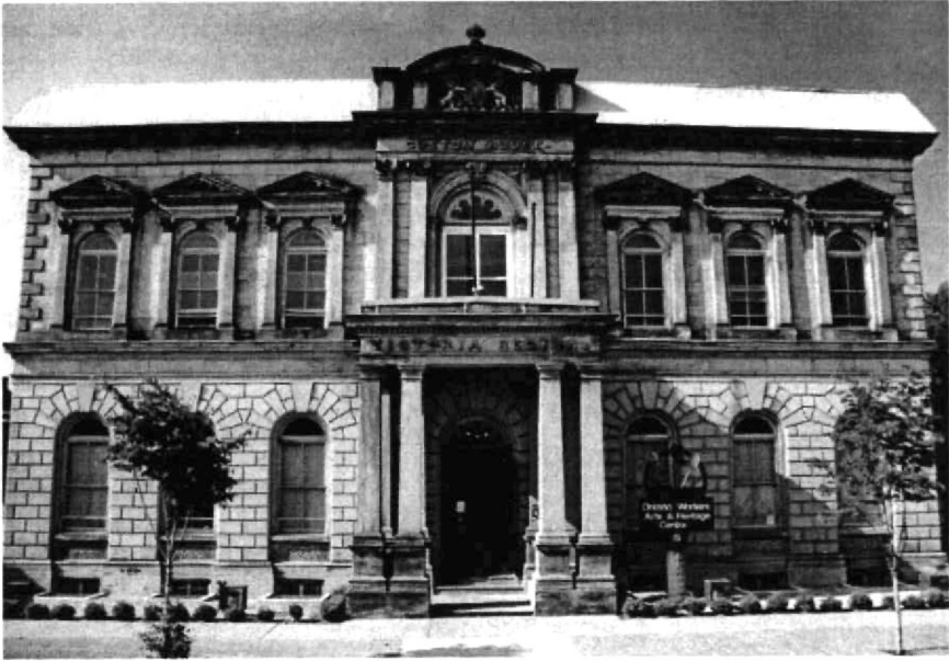
The Ontario Workers Arts and Heritage Centre (formerly Hamilton's Custom House, built in 1860).

skills to dig deeper into a specific subject. 22 They also recognize the need to communicate to the less well-informed, just as in their undergraduate classrooms or their talks to labour audiences. From its earliest 19th-century forms, the museum was always seen as an educational tool that paralleled other forms of cultural diffusion such as public schools, and, however much museum practices have changed, the didactic, educational role remains predominant. Yet, for the historian, in many ways, the move into public history has meant stepping onto a stage where the script and stage directions are much less familiar. A few historians have worked sporadically with local history societies and museums, and some have begun to teach courses in public history to undergraduate and graduate students. But most university-based historians have never done this kind of work, nor been trained to undertake it. Moreover, it is not highly valued within the academic reward system of tenure and promotion, nor supported by most agencies of scholarly funding. 23