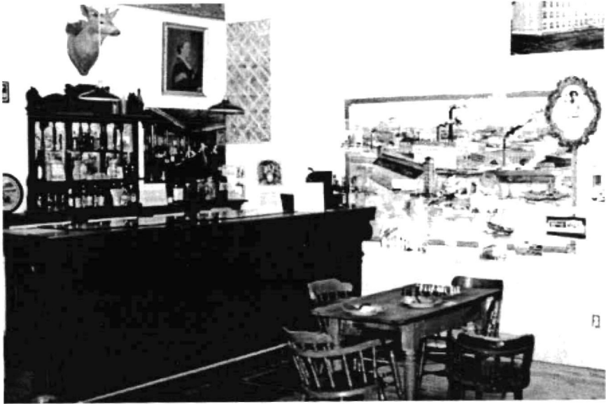
A turn-of-the-century saloon in the 1998 OWAHC exhibition "Booze: Work, Pleasure, and Controversy."

the chance to contribute to a catalogue or handout, but the space is limited, and the prose must be sparse. They are exhorted not to write out their books on the wall, since visitors to heritage installations have little tolerance for excessive wordiness. 60 Most of their written contributions to public history are short paragraphs mounted on text panels alongside or embedded within a display. Far more of their analysis must be communicated visually (or perhaps orally) through the selection and presentation of artifacts, the arrangement of space within the exhibition, and the use of lighting and sound. Museum installations are also increasingly interactive, involving hands-on contact with displays and access to CD-ROMs, interactive videos, and motion-activated lighting and sound. Historians' expertise rarely extends to these media. As an American museum administrator has suggested, "an exhibition or a historic site is much more than the written text of labels and conveys much more complex information through spatial relationships, visual images, real things, and social interactions in a three-dimensional environment that is social, multisensory, and largely self-directed." 61