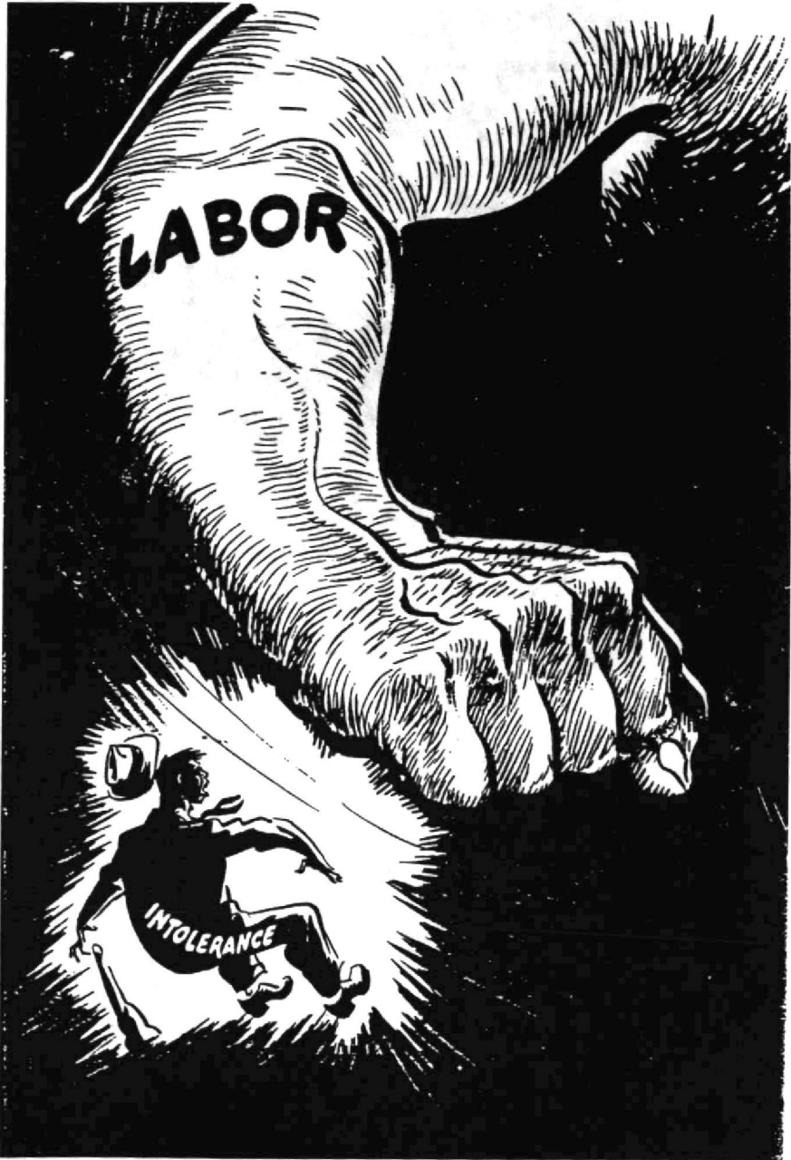
Canadian Labour Reports.