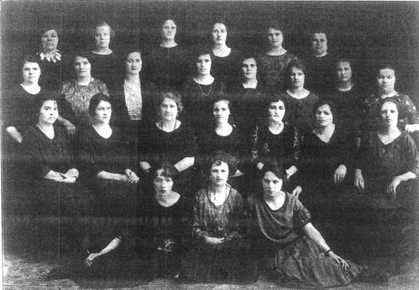
Department of Working Women, East Kildonan, Manitoba.

within the Party itself. Many Ukrainian Canadian women who read Robitnytsia did come from rural backgrounds, or were initially illiterate, yet a reading of their newspaper, produced for and, occasionally, by them, reveals an early experiment in gender and class consciousness-raising that remained unique in the history of the North American Left.