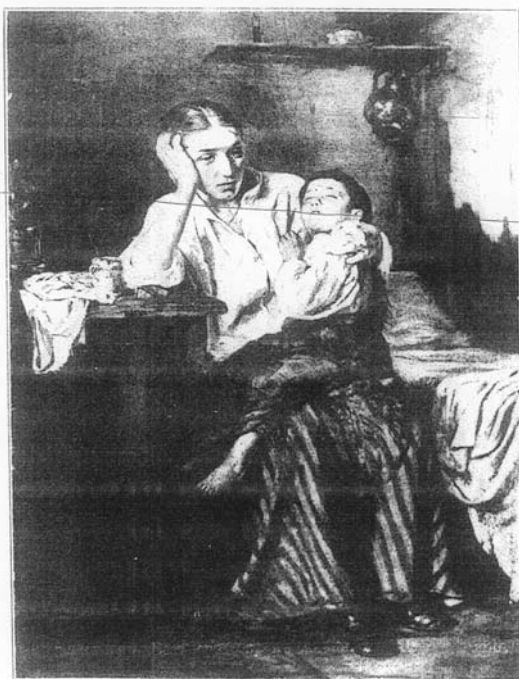
БЕЗ СРЕДСТВ ДО ЖИТТЯ.

ІЛЮСТРОВАННИЙ ЖУРНАЛ — ВИХОДИТЬ ДВА РАЗИ В МІСЯЦЬ