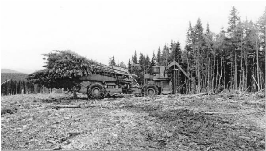
A Feller-forwarder.

Though the final two stages were approximately conterminous, the feller-buncher stage possesses a much greater developmental significance than that of the