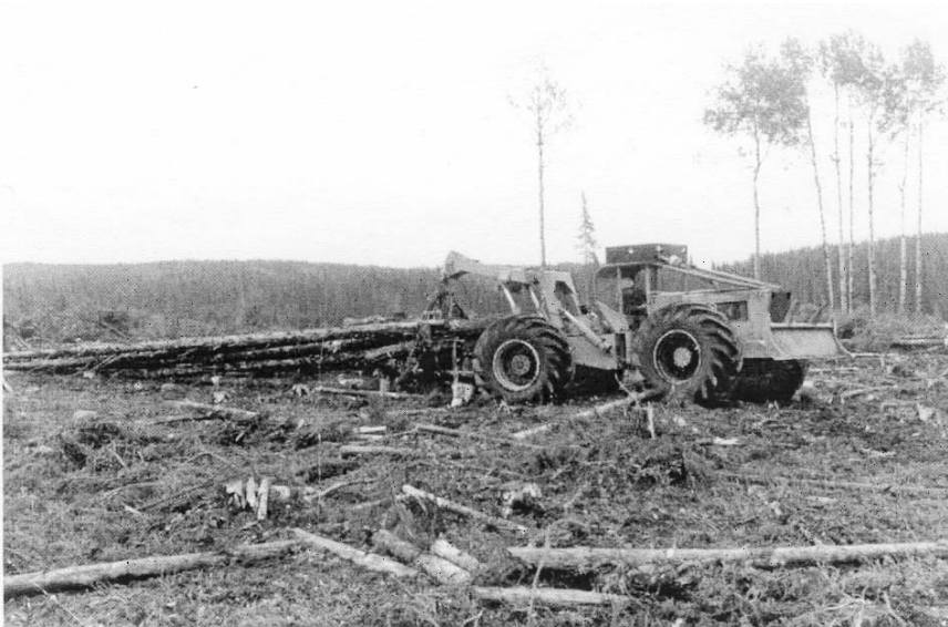
A grapple skidder.