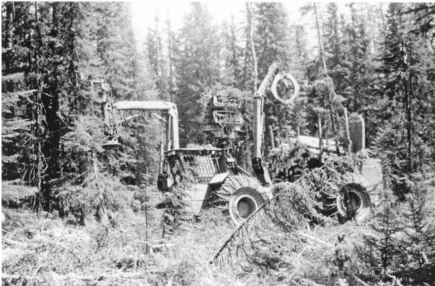
Koehring Shortwood Harvester.