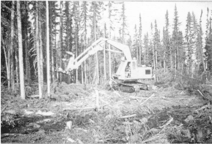
Early feller-buncher.

feller-forwarder. Not only was it more numerous, it has persisted to the present while feller-forwarders have disappeared. 36