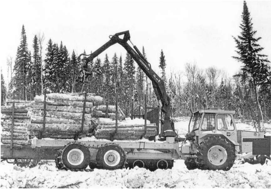
A contemporary forwarder.