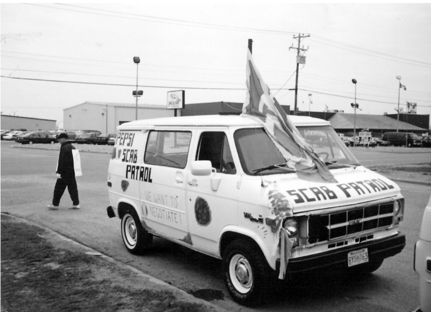
Pepsi Scab Patrol 2.