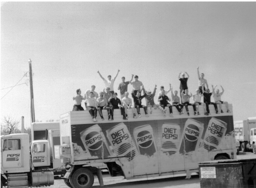
Stratagem Session. RWDSU Saskatchewan Files