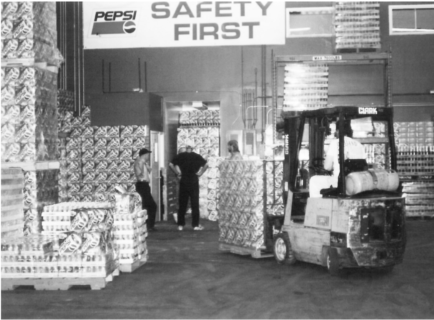
Plant Occupation. RWDSU Saskatchewan Files