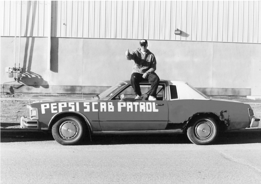
Pepsi Scab Patrol 1. RWDSU Saskatchewan Files