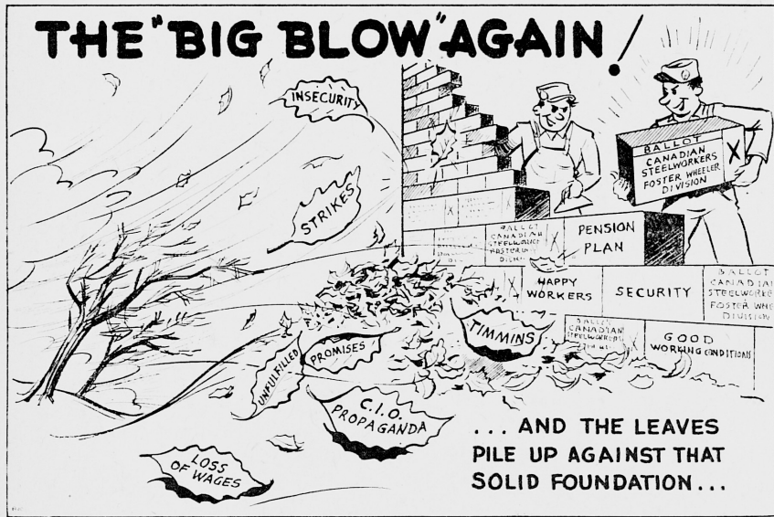
Employer-sponsored cartoon depicting corporate welfare as indicative of the advantages of the Canadian Steelworkers (Foster Wheeler Division) over industrial unions, the Canadian Steelworker Foster Wheeler Division , October, 1951.