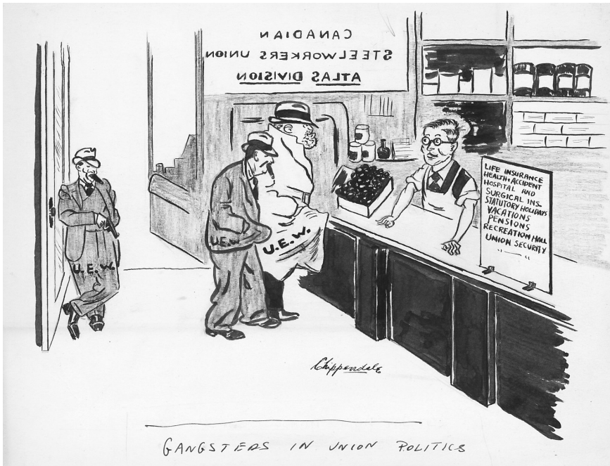
Employer-sponsored cartoon during competition for representing Atlas Steels workers between the United Electrical, Radio & Machine Workers Union and the Atlas Employees Association, 1942.