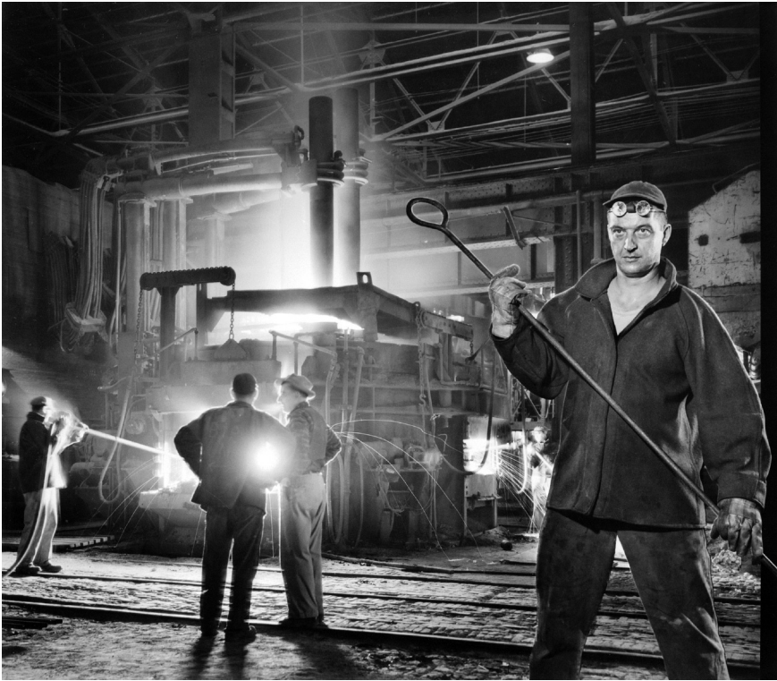
Atlas Steels worker, Welland, Ontario, 1950.

PA-180919.