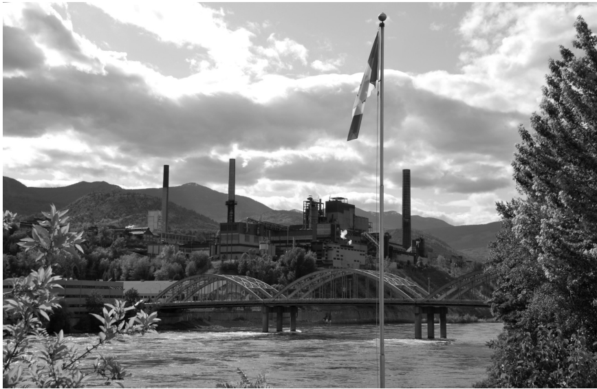
Today, the Trail smelter employs about 1,200 workers and is owned by the multinational Teck Resources Ltd.