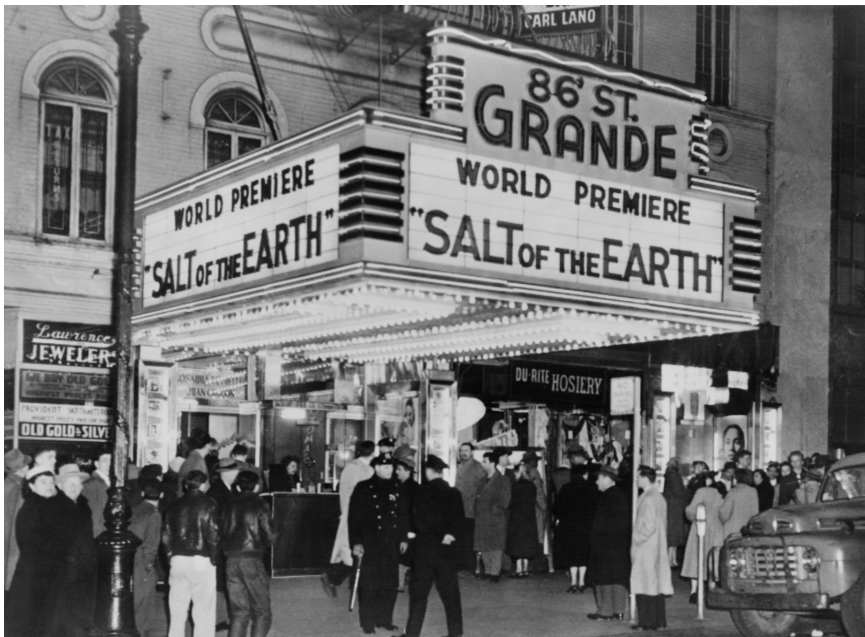
The banned movie finally opened at the Grande Theatre in New York City, but only thirteen theatres across the United States offered screenings. The Castle Theatre showing made it fourteen.