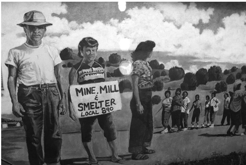
One of several visual memories of the Salt of the Earth strike is the mural painted on the Local 890 hall. In late 2014, the local under a new number voted to decertify.