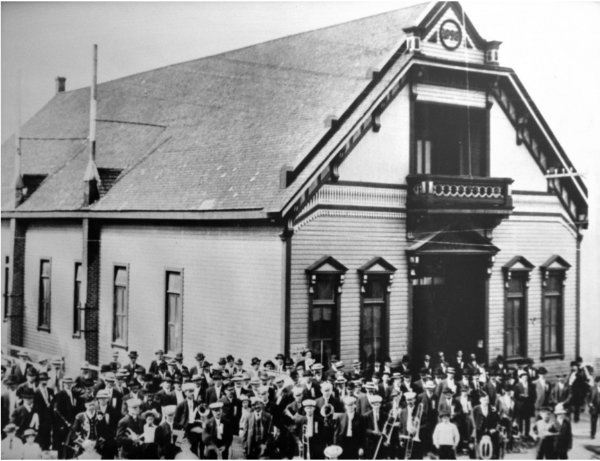
The historic Rossland Miners' Union Hall, built in the 1890s, was the venue for many Mine-Mill conferences and other events including the founding conference of the autonomous Canadian Mine-Mill in 1955, the year after the initial Salt showing.

of informing members of the international union's fight to show Salt , the November edition of the District News announced that the "celluloid curtain" had finally risen allowing Salt to be shown in the Kootenays. 96 In September, the local believed it had secured one of the Trail theatres but it was mistaken. The Strand and Odeon theatre managers at first seemed willing to show the film, but the "top brass put their foot down." The Commentator opined that "we as free Canadians (?) are not to be exposed to a film that portrays the life and love story of a Mexican-American miner and his wife by the veto of these high movie magnates." 97 The union's leaders were not to be foiled in their attempts to defy McCarthyism. If the Trail cinema owners were joining the blacklist crusade, they would search elsewhere.