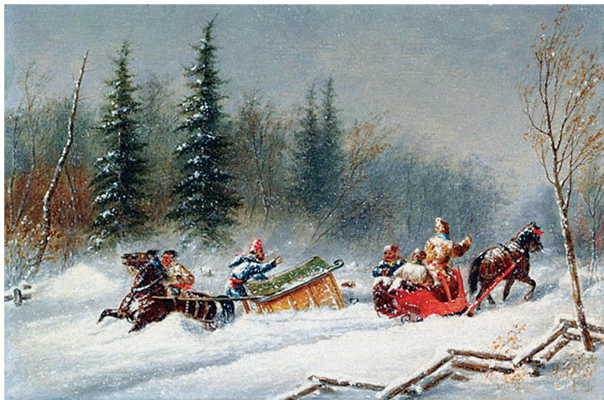
The maintenance of winter roads was instrumental for the highway system of New France. Cornelius Krieghoff, Run Off the Road in a Blizzard , n.d. [19th century], oil on canvas.