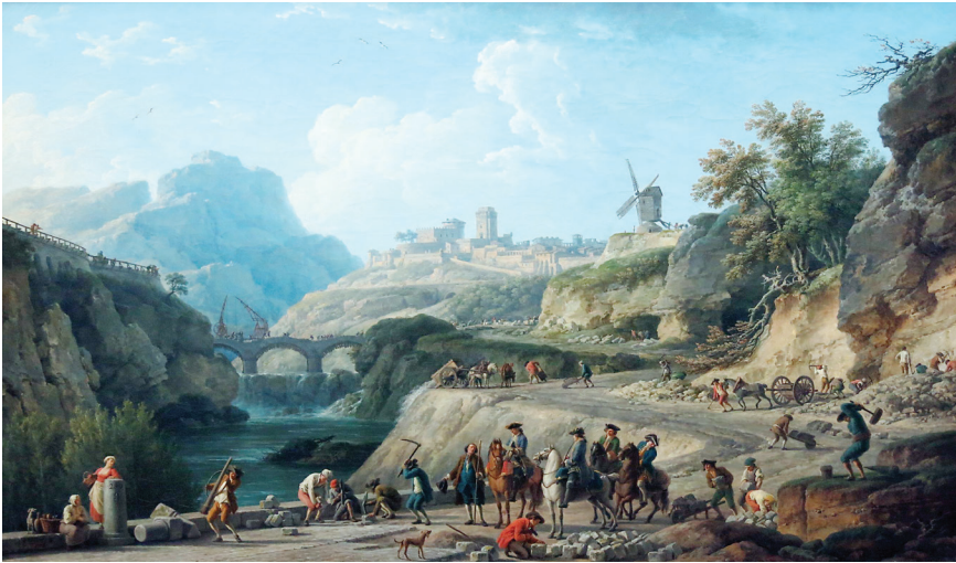
Claude-Joseph Vernet, La construction d'un grand chemin, 1774, oil on canvas. Musée du Louvre, Paris.

was felt most on the seigneurie, large estates operated by a lord and worked by inhabitants. Taxes, in the form of labour ( corvée ), money ( cens ), and goods ( banalités ), were an essential characteristic of rural life in France. Customary civil law functioned to mitigate some of the exploitation an inhabitant could experience at the hands of his seigneur and allowed limited opportunities to challenge the élite in court to gain compensation for lost work or crops. 12 As E. P. Thompson states, custom maintains the “unwritten beliefs, sociological norms, and usages asserted in practice but never enrolled in any by-law.” 13 Inhabitants wielded these customs, to the best of their ability, as protective measures against exploitive seigneurs to ensure that they upheld consent and reciprocity.