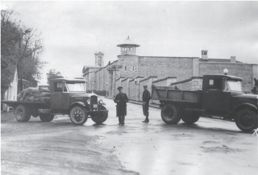
Trucks blockaded the street fronting Kingston Penitentiary, 17 October 1932.