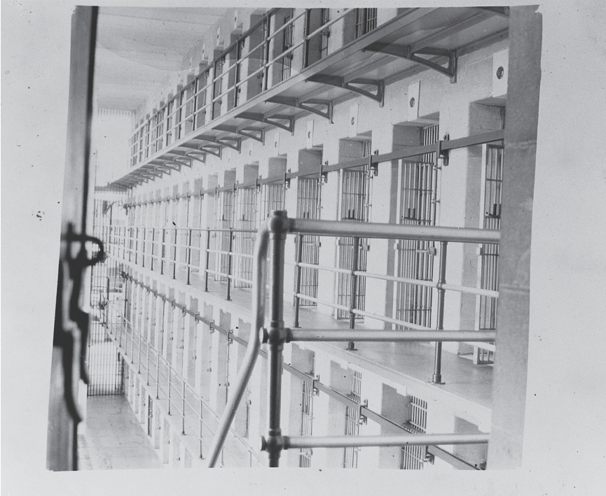
A cell block inside Kingston Penitentiary, typical of the early 1930s.

Globe and Mail fonds, fonds 1266, item 31552, City of Toronto Archives.