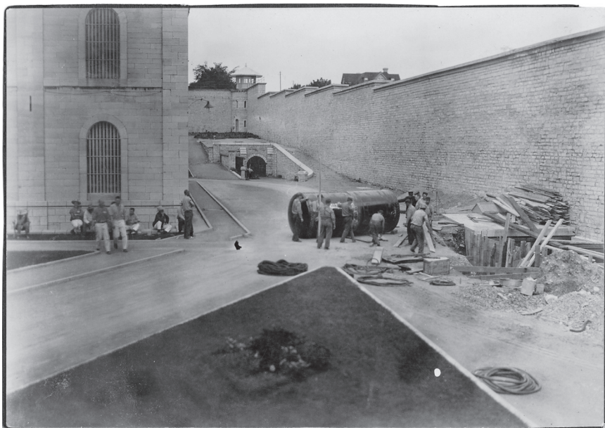
Kingston Penitentiary, 25 October 1933. The prisoners on the left are taking their break outside the south face of the prison hospital, while on the right an excavation team prepares to install a new oil drum.

Globe and Mail fonds, fonds 1266, item 31551, City of Toronto Archives.