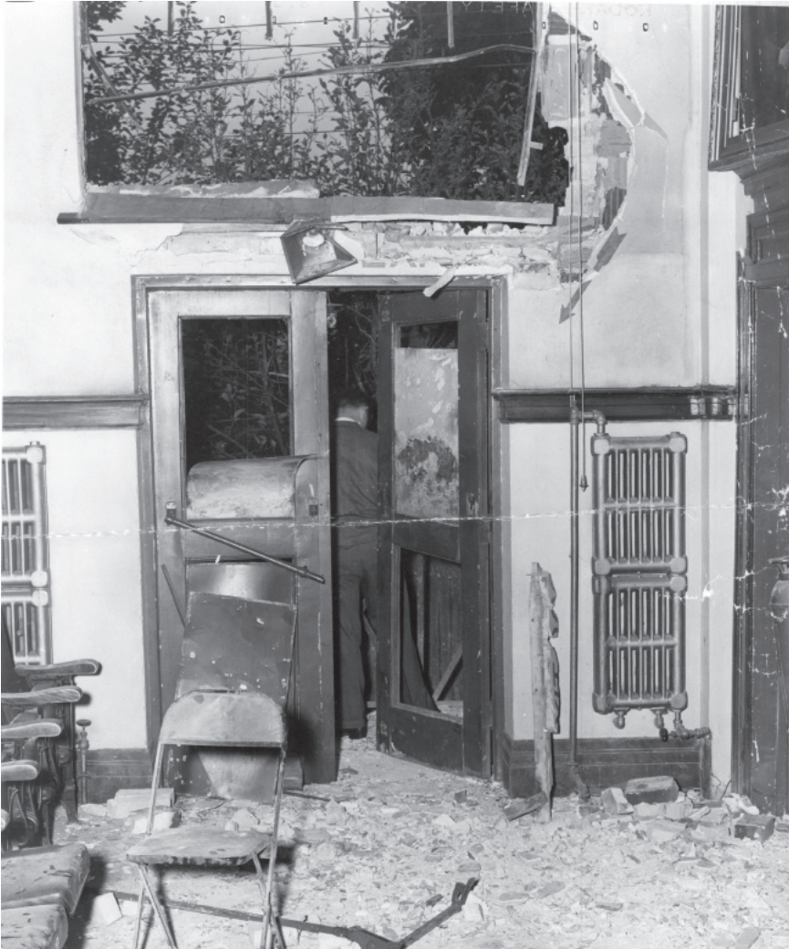
A close-up of the damage, n.d.