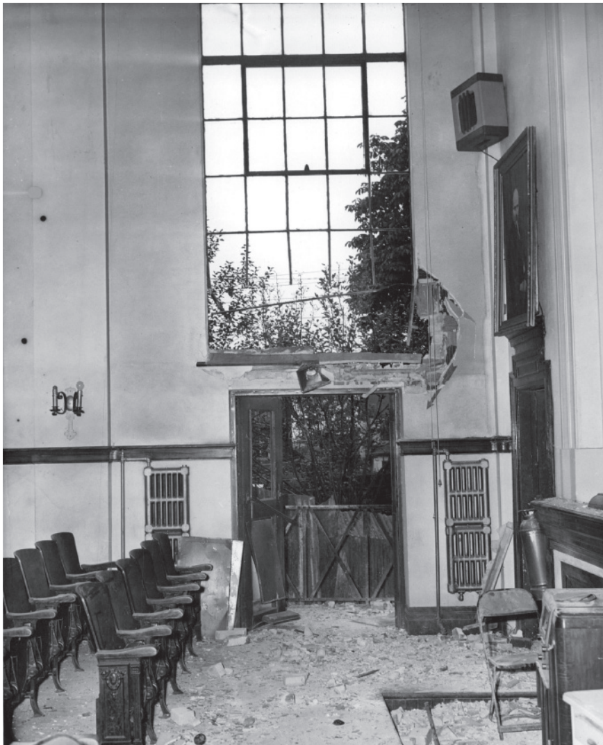
The Labour Temple in the aftermath of the bombing, n.d.