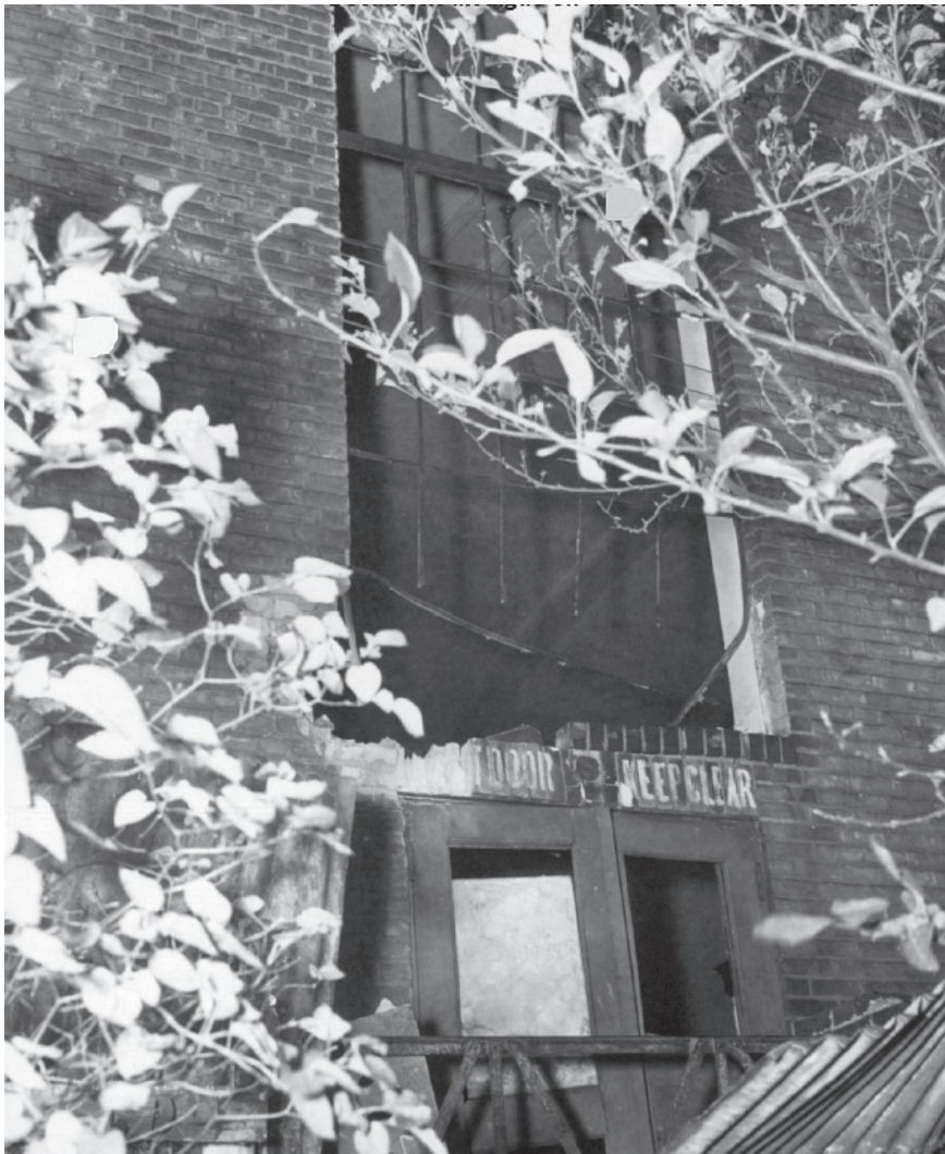
View from where investigators believe the bomb was placed, n.d.

Unlike in Edmonton, the officers could not dismiss this explosion as a stink bomb. They determined that it was either dynamite or nitroglycerine and had been ignited by a fuse and detonator cap. The investigators believed that the explosive had been placed outside, near a fire escape, which was easily accessible from a lane near the back of the building.